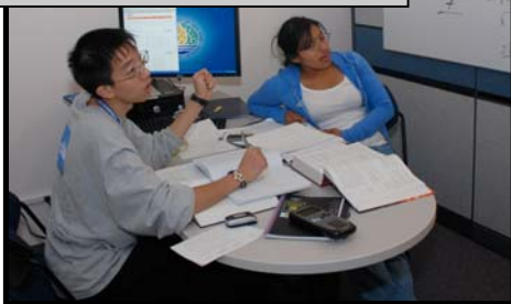
Minds at work in the Center for Academic Excellence

Across the hall from the Center for Academic Excellence is a newly-constructed classroom that can hold up to 24 persons. Like the Library's other four "smart" classrooms,