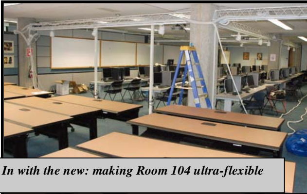
In with the new: making Room 104 ultra-flexible

True to Milne Library's mission "to create an intellectual environment that promotes the search for knowledge and a passion for lifelong learning," great changes have been made to the building's lower level to accommodate an ever broader array of student needs.