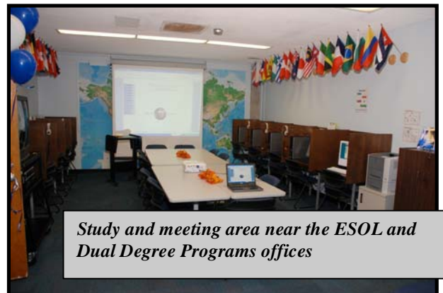
Study and meeting area near the ESOL and Dual Degree Programs offices

The ability of this special room to be "torn down" allows the space to be used as an events hall or auditorium for library and campus events, with a capacity of 125 persons.